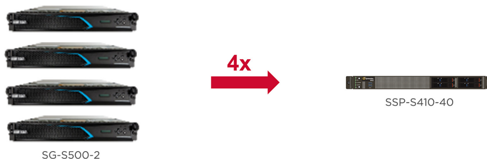
Figure 2: SSP-S410-40 offers eight times the performance for each unit of rack space.

While most organizations have deployed the industry-leading SWG solution from Symantec to their dedicated, on-premises appliances, moving security to the cloud is still a major objective. In addition to high performance physical appliances, SWG solutions can be delivered as virtual appliances (SG-VA), private cloud, or as a cloud-hosted, SaaS solution (Web Security Service) to meet the unique security needs of any organization.